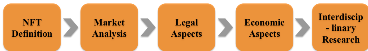
Figure 1. Value chain of NFT creation: definition, market, legal aspects, and evaluation [compiled by the author based on the research materials]

The business model is focused on operations and processes, while the strategy takes into account external competition. Analysis of business models is particularly useful when complex technologies and processes are combined [5]. Business model innovations are often associated with changes in blockchain technologies and their applications, aimed at improving existing problems or adding new services. Blockchain technologies contribute to the modernization of decentralized platforms. [6, c 307]